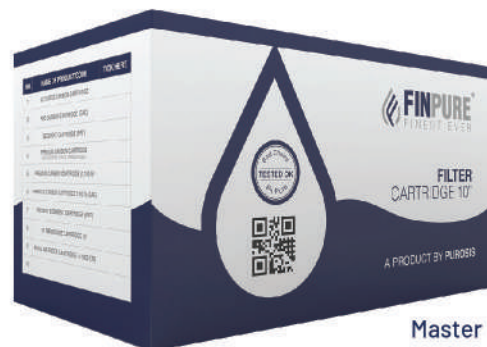
Master Packing 10" - 100 PCS / 20" - 50 PCS