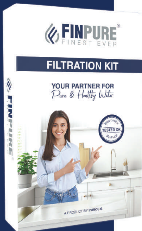
Single Box Packing