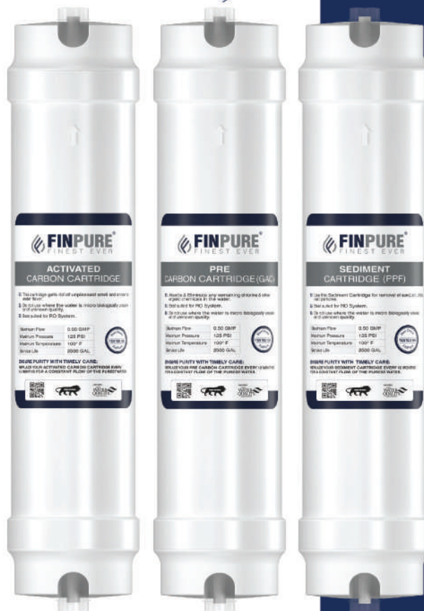
10" (H) x 2.5" (D)