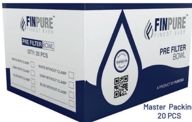
Master Packing 20 PCS