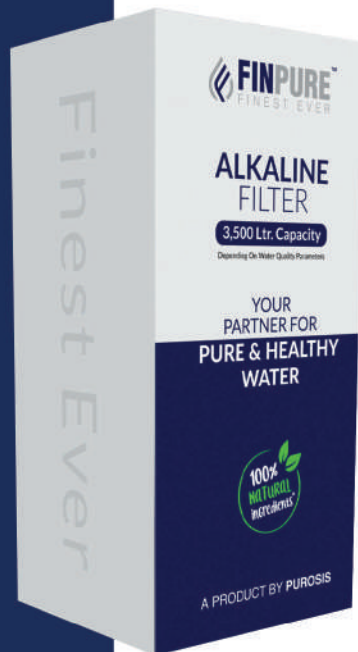
Single Box Packing

4-inch Alkaline Filter 3,500 Ltr offers mineral-enriched water for residential and commercial use, with easy installation and a capacity of 3,500 liters.