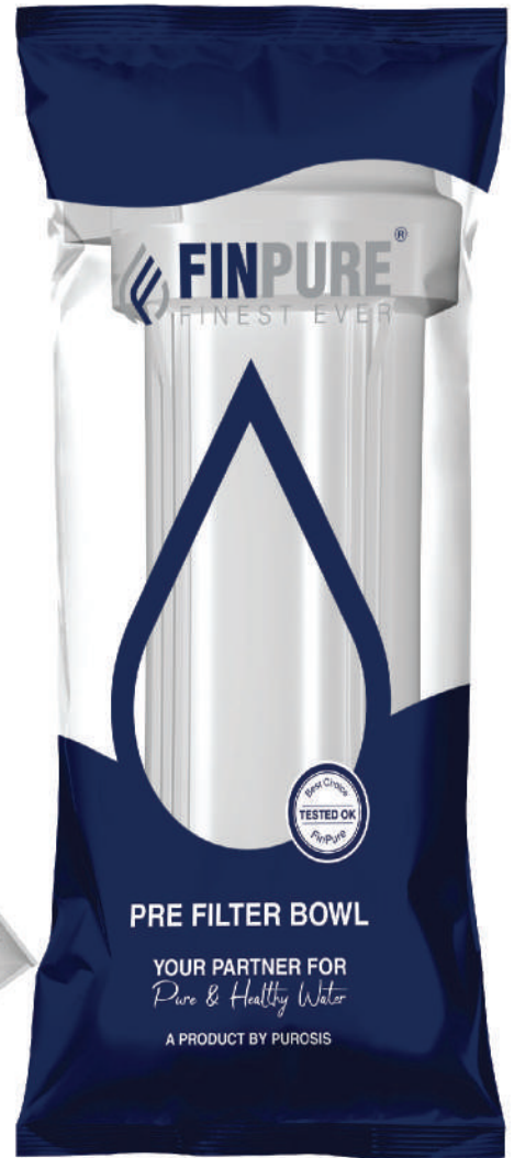
Single Recyclable Plastic Bag Packing

White Pre-Filter Housing combines modern design with durability, efficiently removing sediments before purification. Its sturdy, pressure-resistant build ensures long-lasting performance. Suitable for 75, 80, 90 & 100 GPD RO Membranes of any brand.