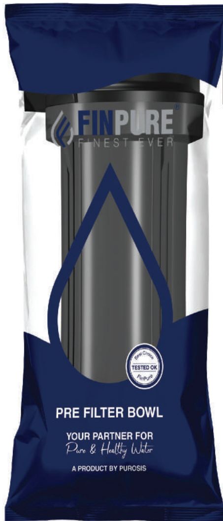
Single Recyclable Plastic Bag Packing