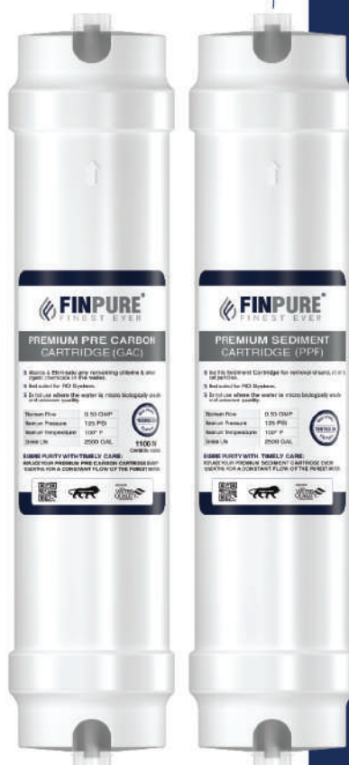
10" (H) x 2.5" (D)