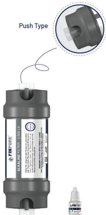
4" (H) x 2" (D)