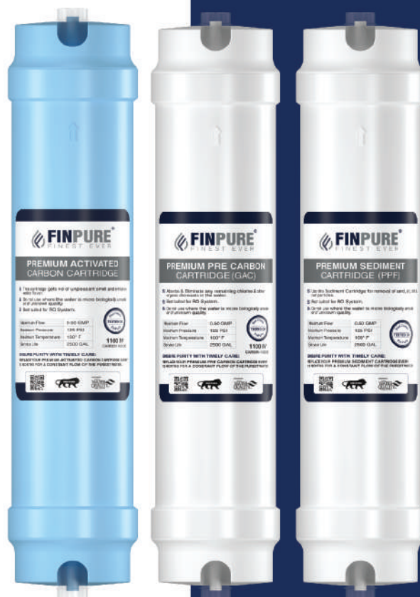
10" (H) x 2.5" (D)