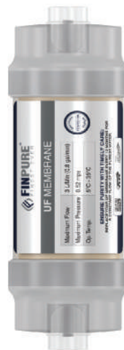
4" (H) x 2" (D)