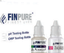
pH & ORP Testing bottles with Alkaline Filter