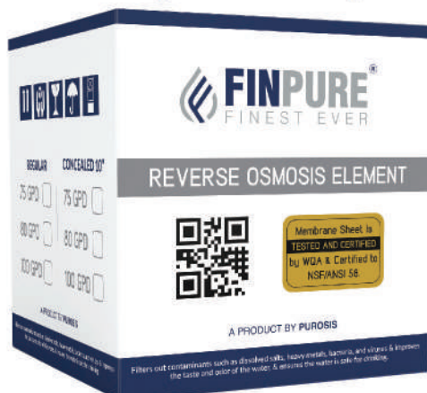
Master Packing 25 PCS