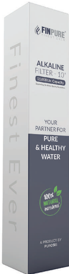
Single Box Packing