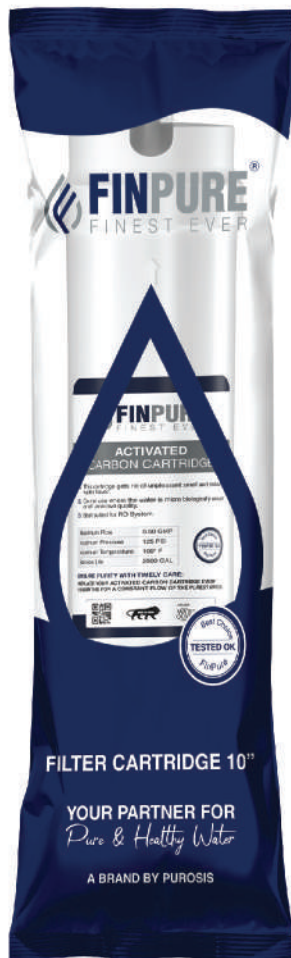
Single Recyclable Plastic Bag Packing