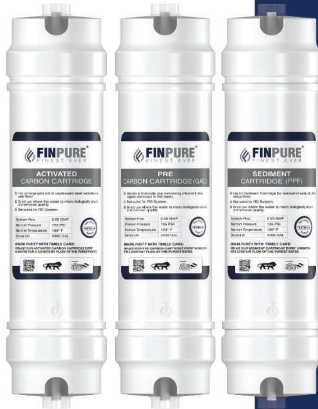
8" (H) x 2.5" (D)