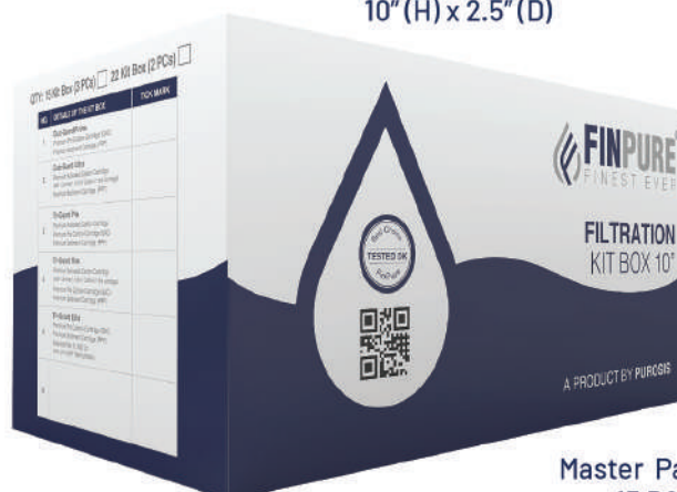
Master Packing 15 PCS

Tri-Guard Max Filtration Kit Box features NSF Certified Premium Activated Carbon (1,100 IV) for contaminants, Premium Pre Carbon Cartridge (GAC) for taste, and Premium Sediment Cartridge (PPF) for fine filtration.