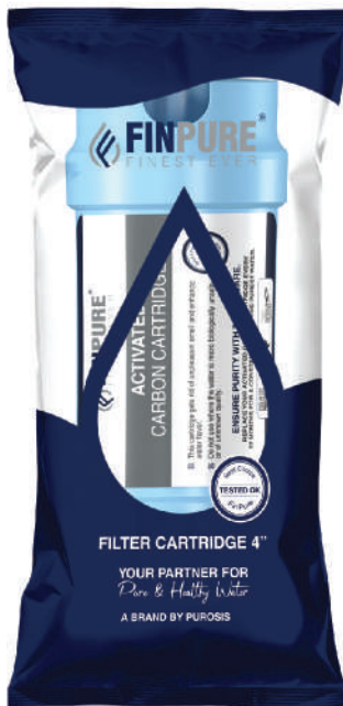
Single Recyclable Plastic Bag Packing