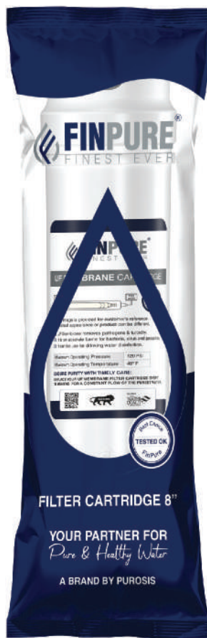
Single Recyclable Plastic Bag Packing