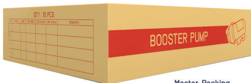
Master Packing 10 PCS