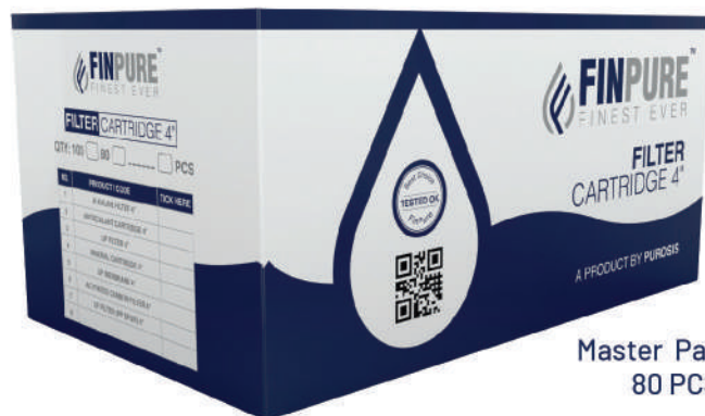
Master Packing 80 PCS