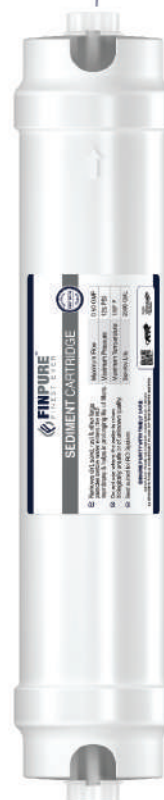
8" (H) x 2" (D)