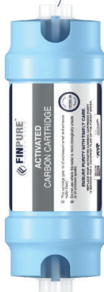
Activated Carbon Cartridge