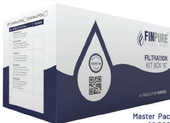
Master Packing 22 PCS