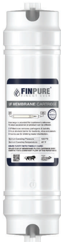
8" (H) x 2.5" (D)