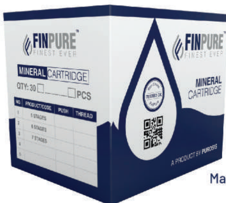
Master Packing 30 PCS