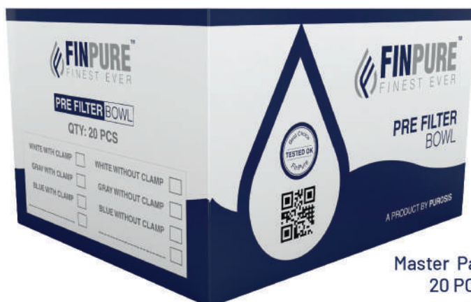
Master Packing 20 PCS