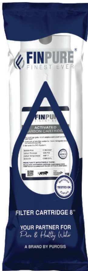
Single Recyclable Plastic Bag Packing