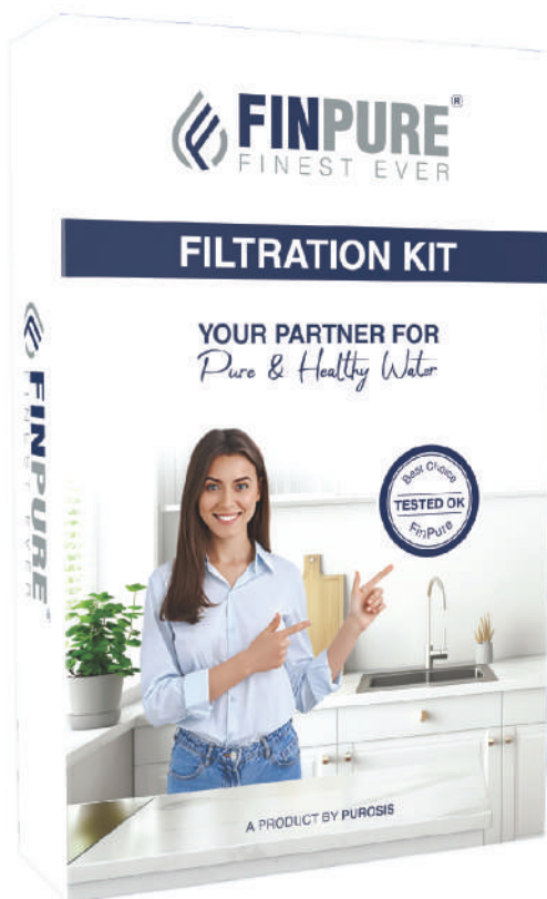
Single Box Packing