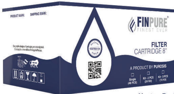
Master Packing 48 PCS

4" Cartridge comes in a single recyclable plastic bag, with 100 pieces per master packing