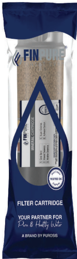
Single Recyclable Plastic Bag Packing