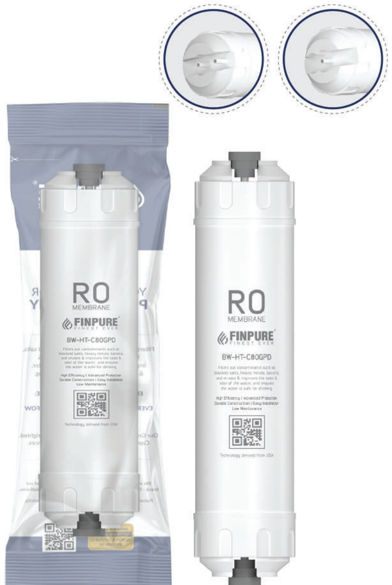
Single Recyclable Plastic Bag Packing