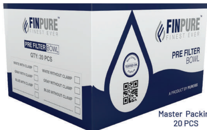
Master Packing 20 PCS

White Pre-Filter Housing combines modern design with durability, efficiently removing sediments before purification. Its sturdy, pressure-resistant build ensures long-lasting performance. Suitable for 75, 80, 90 & 100 GPD RO Membranes of any brand.