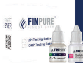
pH & ORP Testing Bottles