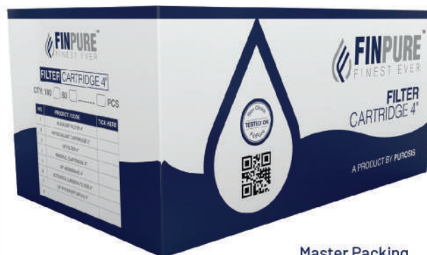
Master Packing 100 PCS

UF Cartridge removes bacteria, while UF Filter (PP Spun) eliminates sediments, ensuring clean water with easy installation and lasting performance.