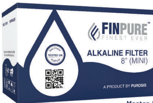
Master Packing 45 PCS