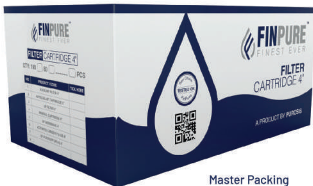
Master Packing 100 PCS

Activated Carbon Cartridge removes contaminants and odors, while the Antiscalant Cartridge prevents scaling, ensuring clean, safe water with easy installation and long-lasting performance.