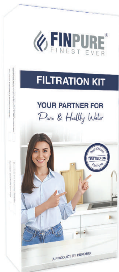
Single Box Packing