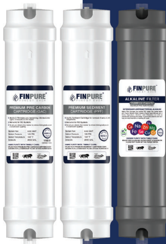
10" (H) x 2.5" (D)