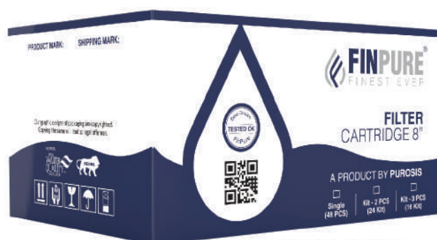
Master Packing 24 Set

This filtration solution includes a Pre Carbon Cartridge (GAC) & Sediment Cartridge (PPF) for chlorine & odor reduction, ensuring clean & safe water. Designed for durability & easy installation, it's ideal for residential & commercial filtration systems.