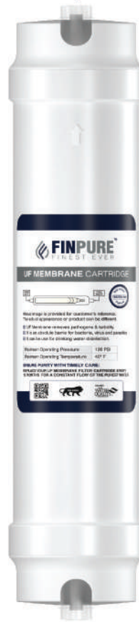
10" (H) x 2.5" (D)