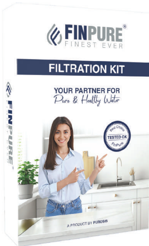
Single Box Packing