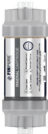
4" (H) x 2" (D)