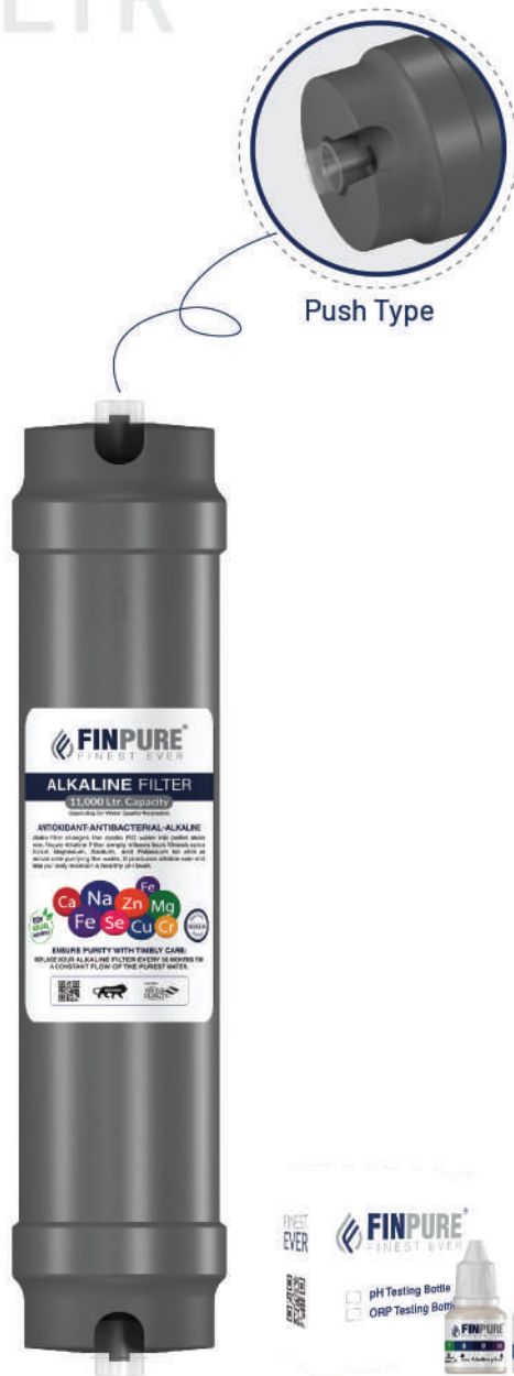
10" (H) x 2.5" (D)