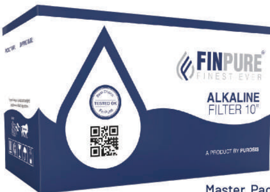
Master Packing 45 PCS

10-inch Alkaline Filter 11,000 Ltr with ORP and pH Bottle filters up to 11,000 liters, providing balanced, clean water with monitored antioxidant and pH levels—ideal for homes or offices.