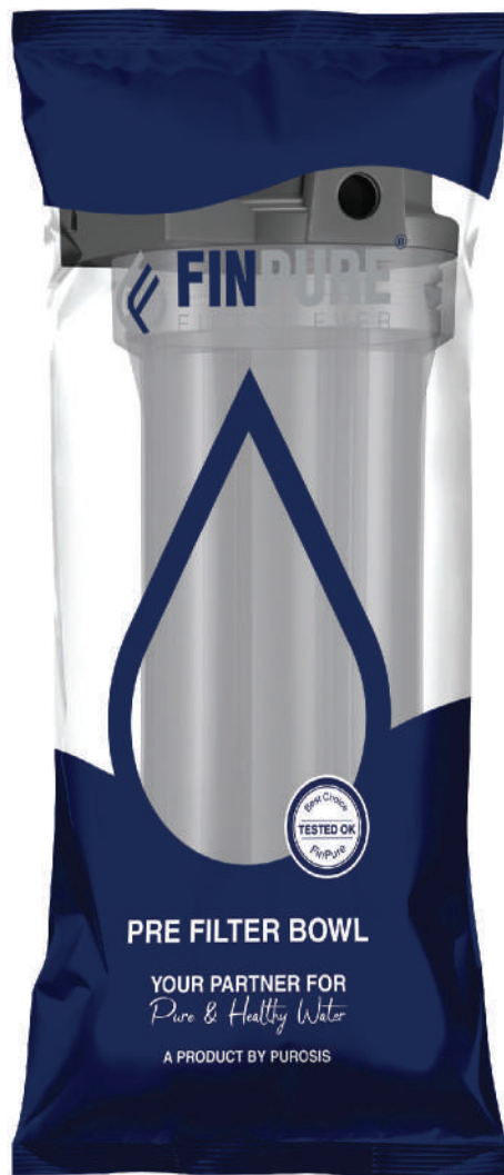
Single Recyclable Plastic Bag Packing