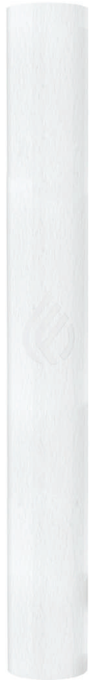
20" (H) x 2.5" (D)