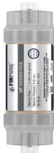
4" (H) x 2" (D)