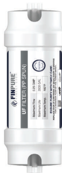
UF Filter (PP Spun)