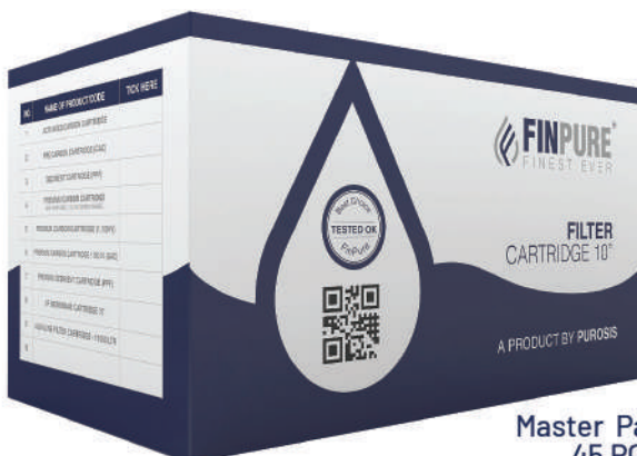
Master Packing 45 PCS

Activated Carbon Cartridge, Pre Carbon Cartridge Cartridge (GAC) & Sediment Cartridge (PPF) ensure effective water purification by removing impurities, odors & chlorine. Regular replacement guarantees clean, safe water daily.