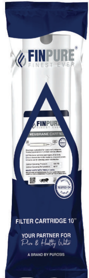
Single Recyclable Plastic Bag Packing