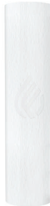
10" (H) x 2.5" (D)