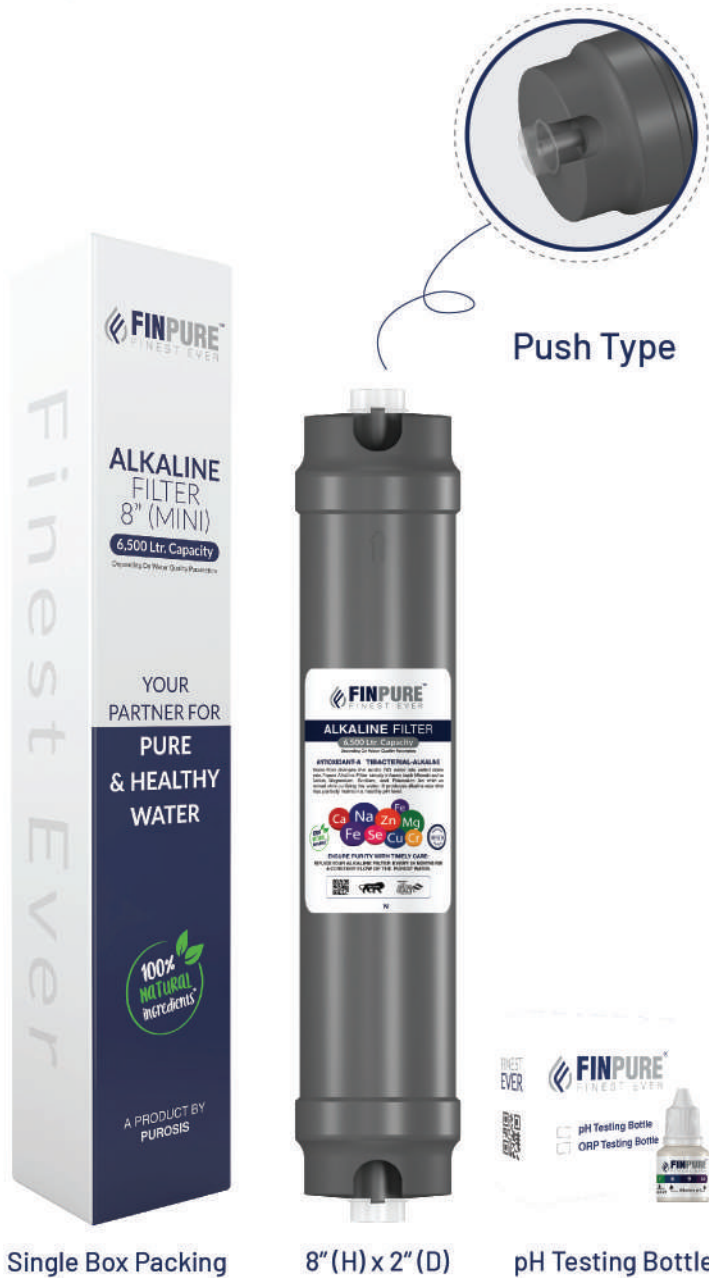
Single Box Packing