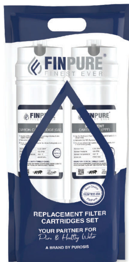
8" (H) x 2.5" (D)