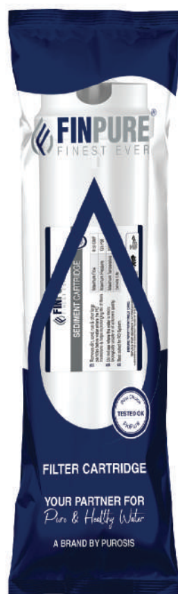
Single Recyclable Plastic Bag Packing