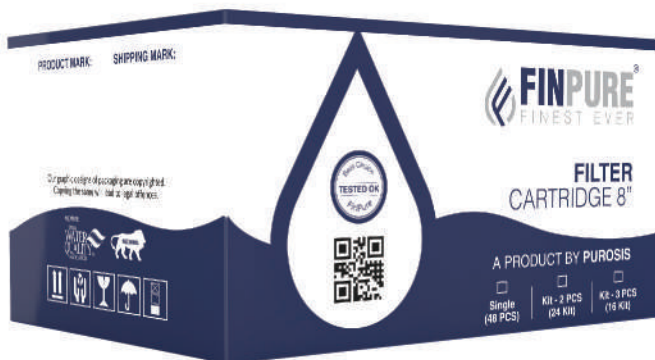
Master Packing 48 PCS