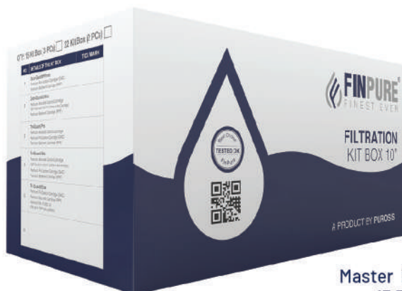
Master Packing 15 PCS

Tri-Guard Pro Filtration Kit Box ensures pure water with three high-quality filters: the Premium Activated Carbon Cartridge for chlorine and odor removal, the Premium Pre Carbon Cartridge (GAC) for impurities, and the Premium Sediment Cartridge (PPF) for dirt and rust.