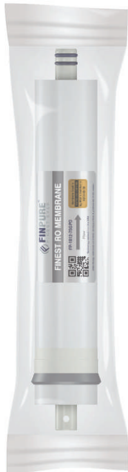
Single Recyclable Plastic Bag Packing