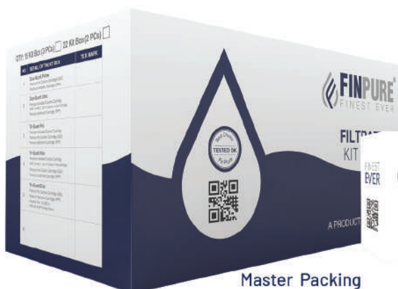
Master Packing 15 PCS

Tri-Guard Elite Filtration Kit Box ensures pure, healthy water with Premium Pre Carbon Cartridge (GAC) for chlorine, Premium Sediment Cartridge (PPF) for dirt and rust, and an Alkaline Filter for pH balance and hydration.