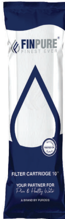
Single Recyclable Plastic Bag Packing

10 & 20-inch PP Spun Filtration system removes dirt, sediments, and rust, extends filter life and enhancing water quality.