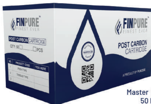
Master Packing 50 PCS

effectively removes dirt, rust and impurities, ensuring clean and clear water. Its durable design provides long-lasting filtration with easy installation.