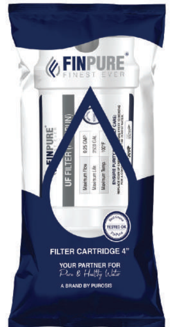
Single Recyclable Plastic Bag Packing