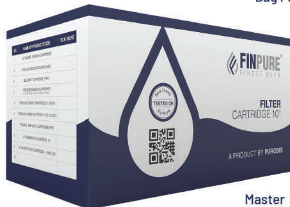
Master Packing 45 PCS