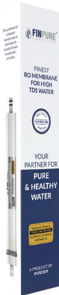
Single Box Packing